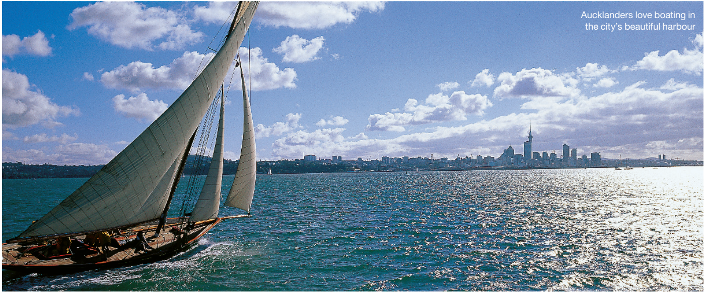
Aucklanders love boating in the city's beautiful harbour