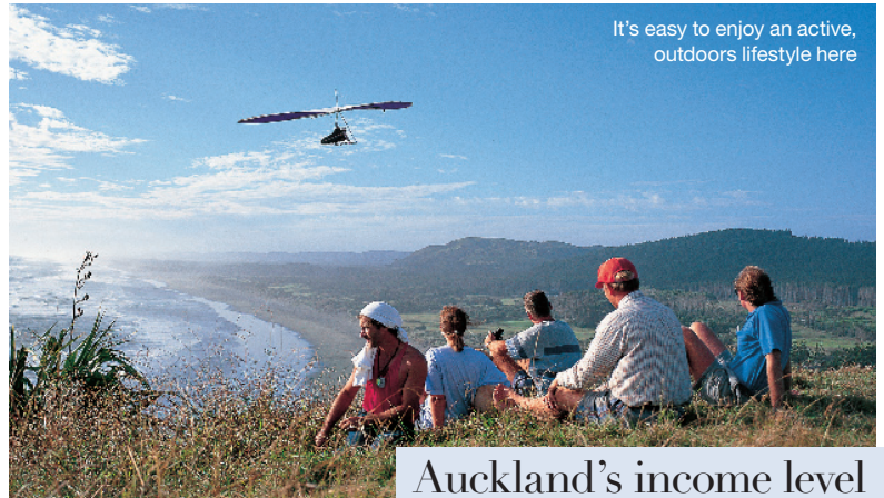
It's easy to enjoy an active, outdoors lifestyle here